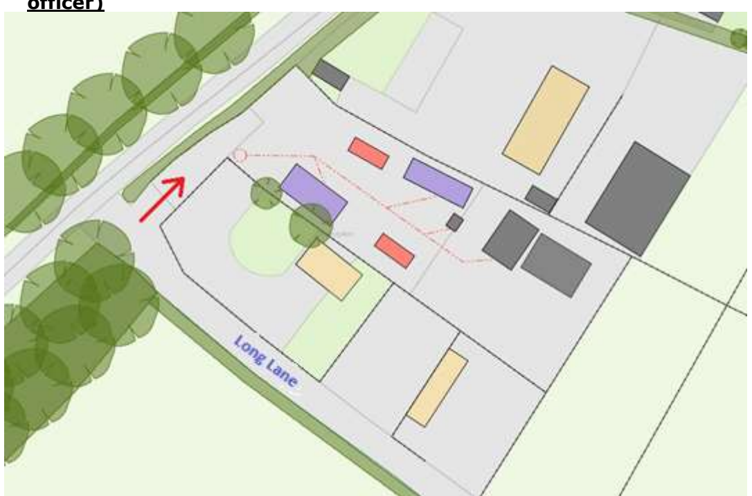
Image 2: Proposed Site Layout Plan (red access arrow added by case officer)

1.04 The application site is accessed at the start of Long Lane, as depicted below which provides access to other sites to the southeast of the application site (Land Adjacent Greengates, 1 Long Lane and Long Lane).