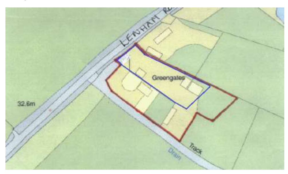
Image 1: Site Location Plan 17/501852/FULL (current application site in blue)